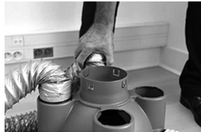
Air extraction system installation